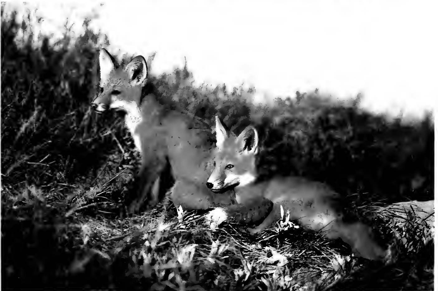
Red foxes: Conrad Rowe